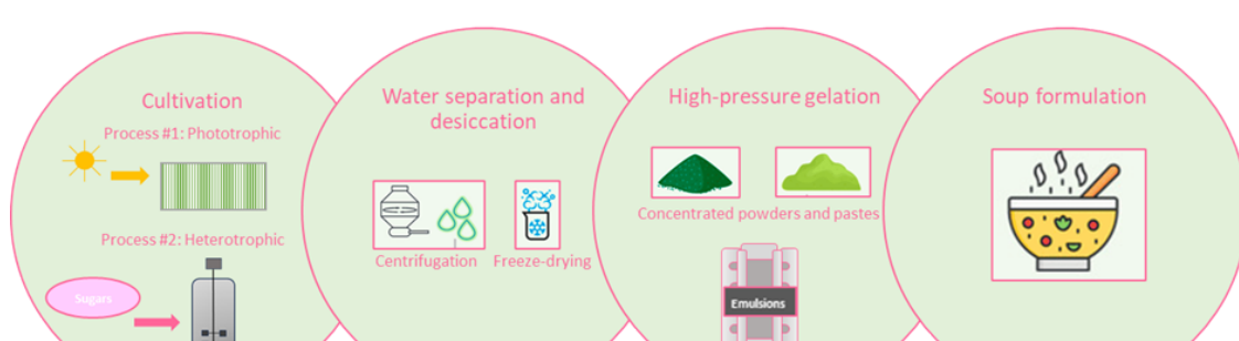
Figure 2. Schematic of the microalgae cultivation and refining processes leading to soup formulation.

Nutraceutical soups will be designed to meet the nutritional needs of, predominantly elderly, dysphagic consumers that have trouble eating conventional foods. To meet these needs, scientists at UCC's School of Food and Nutritional Sciences, will use techniques such as high-pressure gelation to optimise the texture and taste properties of microalgae biomasses to improve palatability while retaining the nutritional value of soups produced. Combining low-cost plant, dual cultivation modes and innovative high-value product formulation in this manner, UCC will contribute to improving the productivity and economic performance of a microalgae biorefining process for northerly EU states.