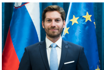
Mark Boris Andrijanič , Minister for Digitalisation, Slovenia

Mark Boris Andrijanič graduated with honours from the Faculty of Law in Ljubljana, and he holds a Master of Public Policy (MPP) degree from the University of Oxford. As of April 2021, he has chaired the Strategic Council for Digitalisation of the Government of the Republic of Slovenia. From 2016 to 2021, he worked for the American technology company Uber, most recently as Head of Public Policy for Central and Eastern Europe. Prior to joining Uber, Mr Andrijanič was a Visiting Fellow at the Wilfried Martens Centre for European Studies in Brussels, where his research focused on the EU's digital and economic policies. Before coming to Brussels, he advised the Government of Sierra Leone on economic reforms. In Slovenia, he co-founded and led several NGOs aimed at promoting active citizenship and entrepreneurship, including Mreža idej (Network of Ideas). He still leads the Oxbridge Club Slovenia, which brings together Slovenians who have studied at Oxford or Cambridge. Since 2017, he has been a David Rockefeller Fellow at the Trilateral Commission and a Millennium Fellow at the Atlantic Council. In 2021, he became a member of the Rotary Club Ljubljana. He has been a speaker at numerous international conferences on new technology both in Europe and the United States.