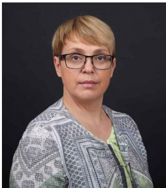
Nataša Pirc Musar , PhD. Attorney, Specialist for Data Protection and Access to Public Information, Slovenia

After graduating from the Faculty of Law of the University of Ljubljana, Slovenia in 1992, she passed the national bar examination in 1997. From 1989 until 1996 she was employed at the Slovenian national television station as a journalist and news presenter for the main news programme. From 1996 she worked for five years as a news presenter on “24 ur”, the primary information programme of the largest commercial television broadcaster in Slovenia, POP TV. In 2003 she became the Director of the Training and Communications Centre of the Supreme Court. From 2004 until 2014 Nataša has held the office of Information Commissioner.