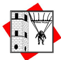
STROJARSKA TEHNIČKA ŠKOLA FAUSTA VRANČIĆA