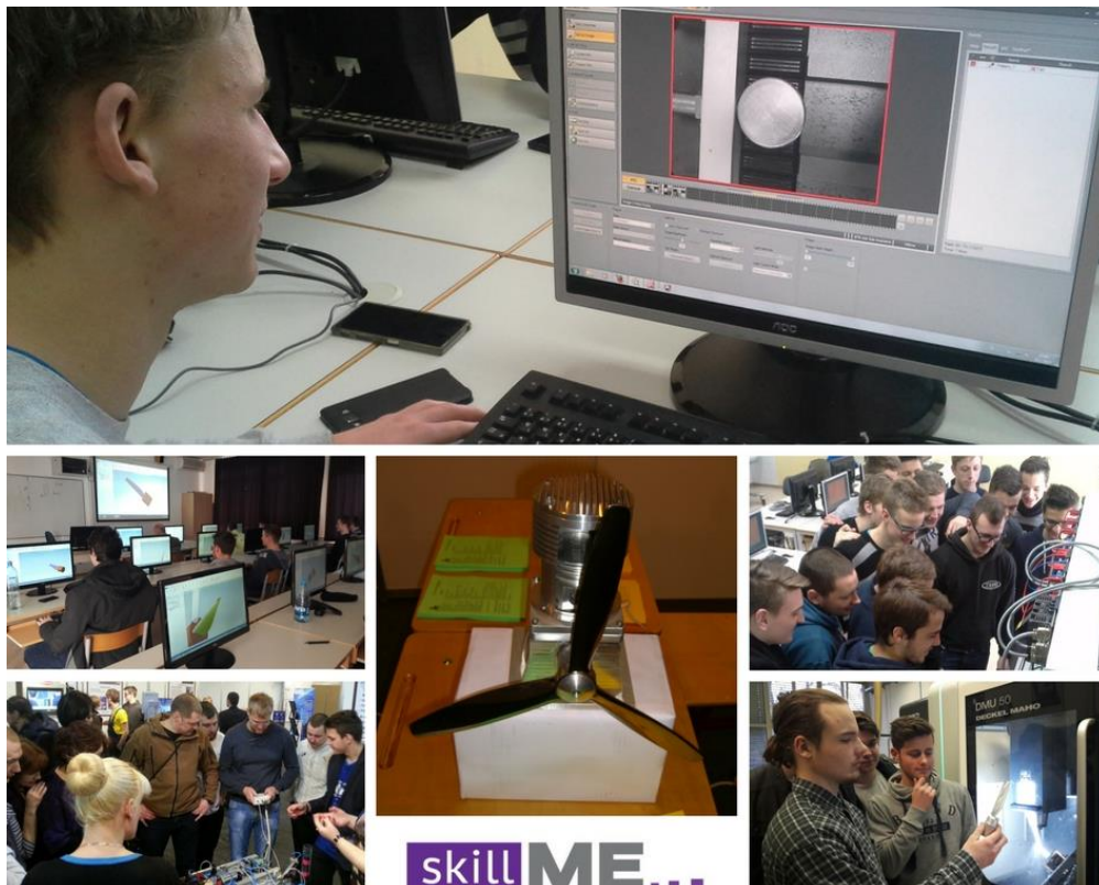
SkillME Pilot trainings implemented in Croatia, Latvia, Slovakia, and Slovenia

In September 2017 , the project partner overseeing pilot trainings implementation, Riga Technical College from Latvia, will prepare a Final Pilot Training Report summarizing all piloting activities implemented on the national level, focusing on the impact of the trainings and recommendations for future activities.