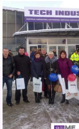
skillME pilot trainings in Latvia

Machine Vision participants (employees) visited Tech Industry 2016