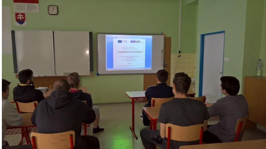
skillME pilot trainings in Slovakia

In Slovakia, pilot training activities were implemented at the project partner school SOŠ Stará Turá and attracted school SOŠIT Bratislava from January to May 2017 after previous studying and preparing materials for teaching and training.