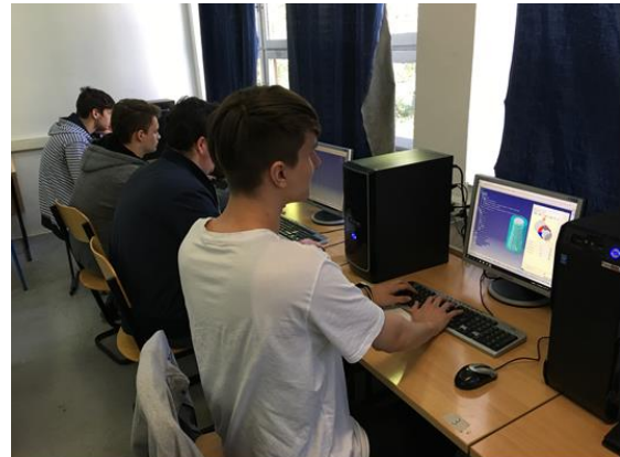
CAD/CAM training for students in Croatia

The Croatian skillME partner school Technical High School Faust Vrancic carried out CAD/CAM and Composite Materials pilot training. CAD/CAM training was done with 13 juniors attending mechatronics technician class during March and April 2017, whereas Composite Materials training was done with 11 sophomores attending Mechatronics technician class during March, April and May 2017.