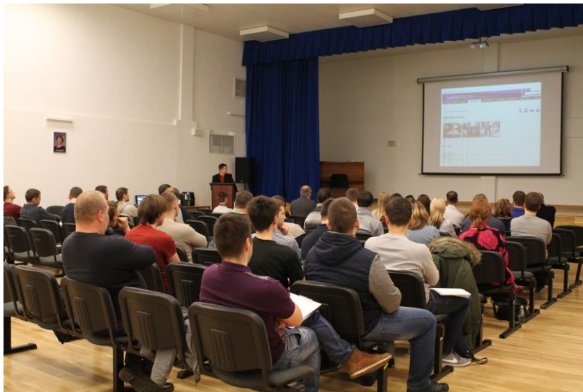
Participants attending the Reading Technical Documentation training in Latvia

In the first half of the project, project partners identified four most pressing skill gaps among students and workers in the metal and electro industry of the participating countries, which are: READING TECHNICAL DOCUMENTATION, CAD/CAM SYSTEMS, MACHINE VISION, and COMPOSITE MATERIALS . Next, partners designed curricula and training materials to fill these gaps. As the field of reading technical documentation varies greatly between the metal and electro industry, two separate curricula have been developed for the sectors. Over the past six months, partners have been implementing pilot trainings for students and separately for workers of metal and electro companies in all of the project countries, i.e. Croatia, Latvia, Slovakia and Slovenia. The piloting is currently in its final phase.