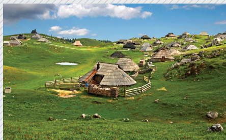
Velika Planina