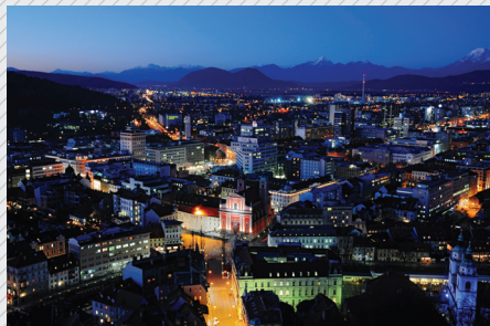
Ljubljana | www.slovenia.info

For more information about Slovenia, please visit www.slovenia.info .