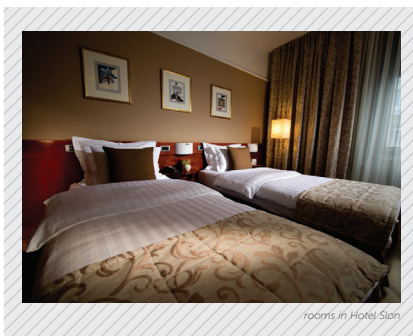
rooms in Hotel Slon